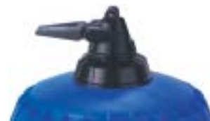
Integrated by-pass : system of turning concentrate injection on and off.

These options allow adapting your Dosatron to your needs. Contact our technical service to help determine what option you may need.